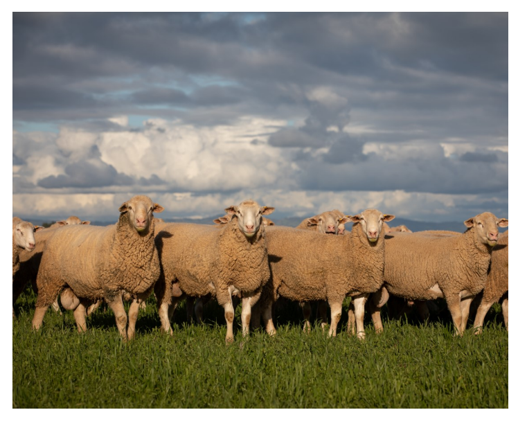
This years sale team will include 200 rams in the top 20% of all terminal rams on LAMBPLAN.

If you have never been to our sale, here are some of the reasons our clients keep returning: