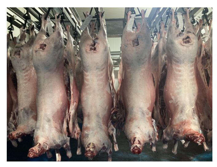
Some of the Ashmore lambs processed at Gundagai Meat Processors in May this year.

GMP really are setting the benchmark with their innovative grid which rewards producers who get genetics and nutrition right to produce the highest quality lambs.